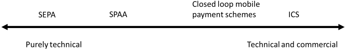
Figure 1: technical vs. commercial schemes

On the other spectrum, schemes go much further and define business rules, dictate end-to-end remuneration models and levels of compensation for participating members as well as mandatory compliance to all rules.