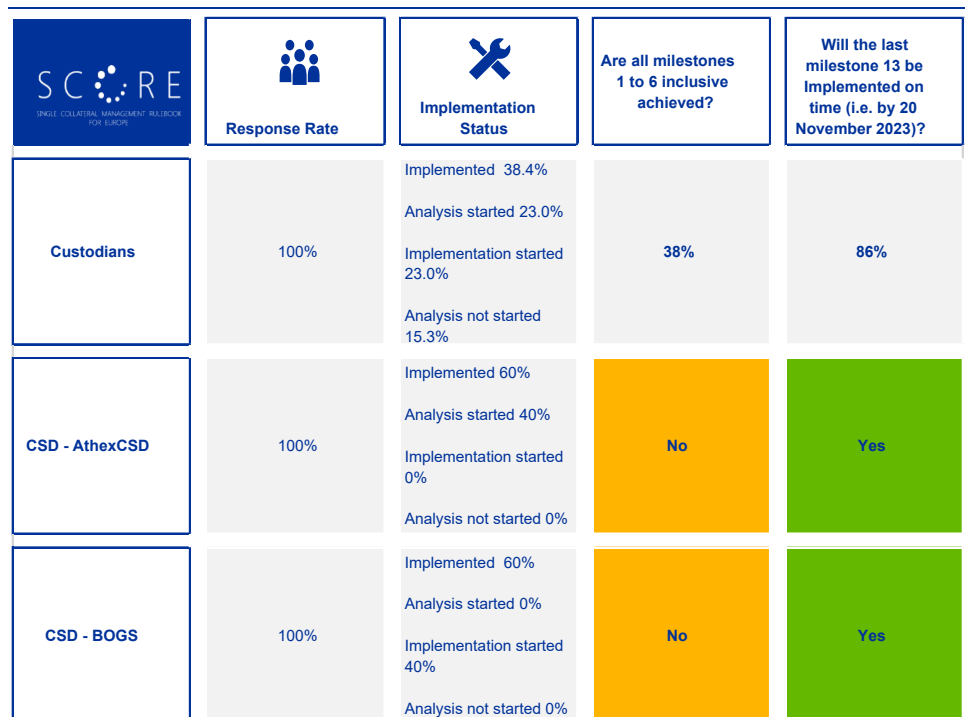
Figure 1 Summary of the monitoring exercise

All the reporting entities in the Greek market have responded to the H1-22 survey. Based on their feedback, the implementation of the Billing Standards in the market is on track with some exceptions which at the moment do not generate major points of concern. Please refer to the below analysis per entity for additional information.