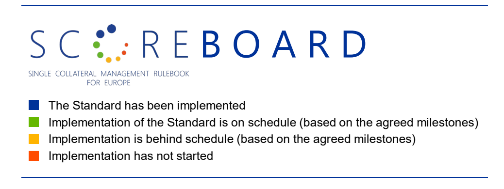
Table 1 Compliance level with the standards by each entity type