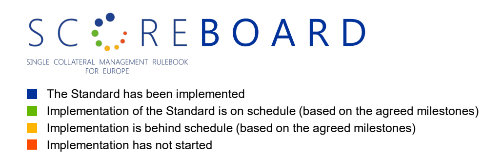
Table 1 Compliance level with the standards by each entity type