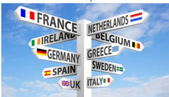
Image shared by a participant to illustrate free movement in Europe