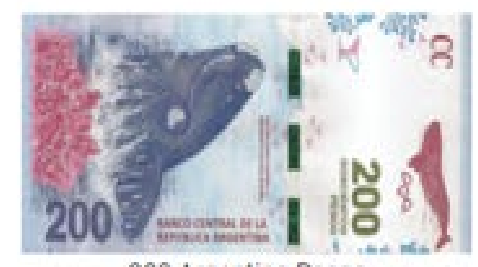
200 Argentine Pesos