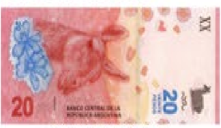
20 Argentine Pesos