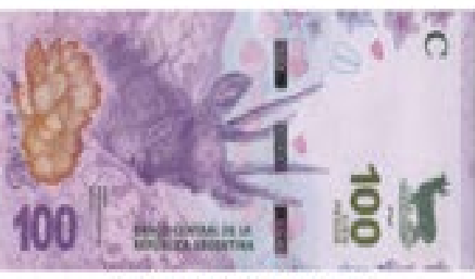
100 Argentine Pesos