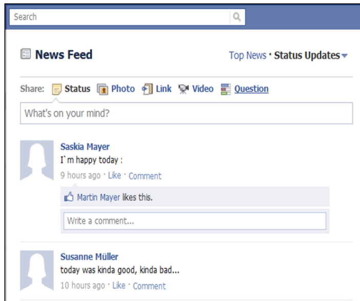
Figure 2: Status Updates in Facebook

Note: This figure illustrates an example of Facebook's start page. The question 'What's on your mind?' shows up in this page whenever the user logs on to Facebook. The status updates and the recent activity of friends in the network will be shown on this page as well.