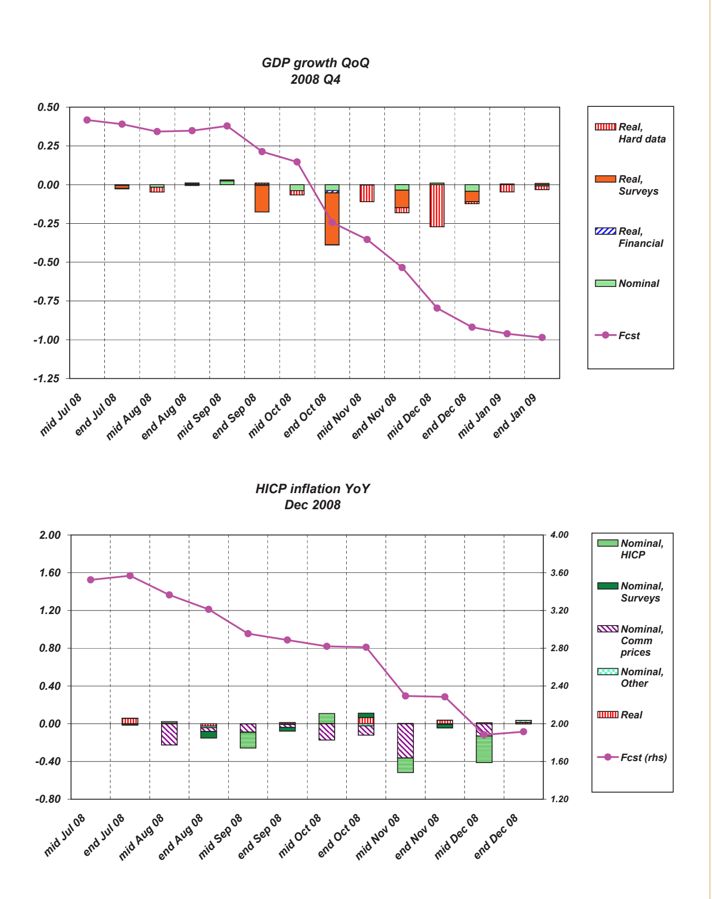
Figure 1: Contribution of news to forecast revisions